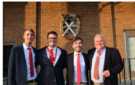
Zeta Alpha Brother with Grand