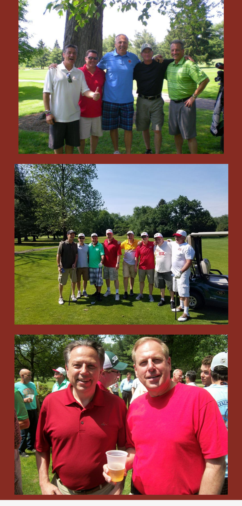
We look forward to seeing you at the 30th Golf Outing and for the largest event ever!