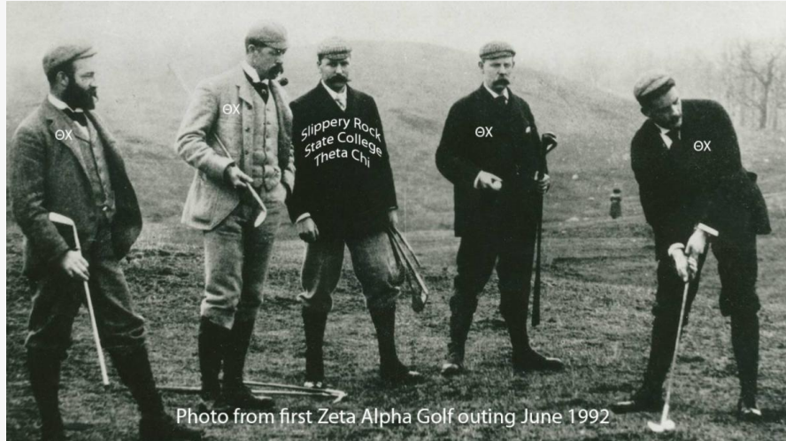
Photo from first Zeta Alpha Golf outing June 1992

REGISTRATION CLOSSES AT MIDNIGHT THIS SATURDAY MAY 20TH TO BE INCLUDED IN THE COUNT FOR GOLF AND FOOD AT THE OUTING.