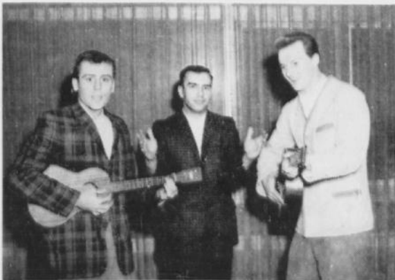
Greeks bring entertainment to campus for all S.R. students.