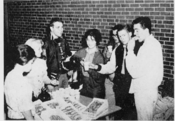
Greeks earn money for service and social functions.