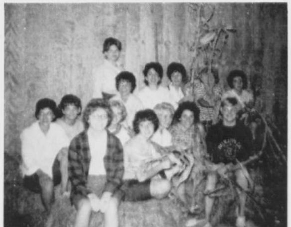
Sponsoring of Hut dances part of Greek activity.