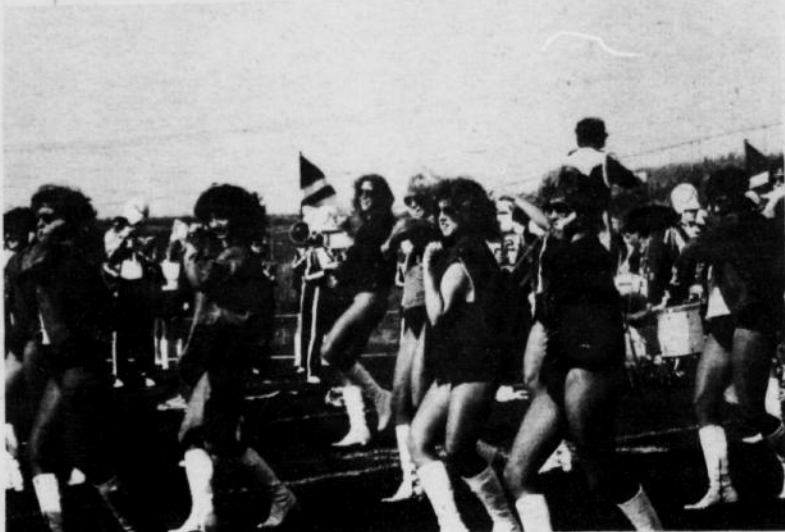
"Beat It" by Rocklettes Saturday half-time.