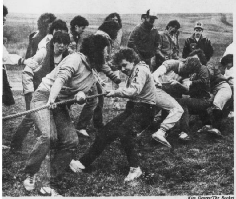
ASTs pull together