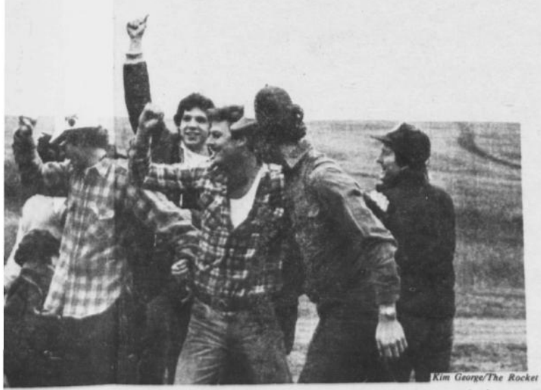
TUG OF WAR: TKEs, the thrill of victory