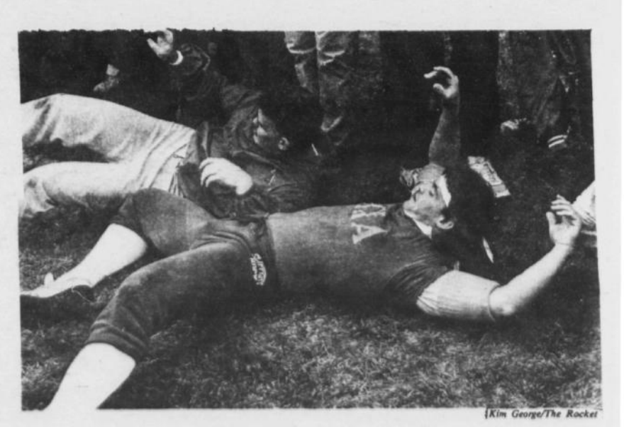
....Lambda Chi, the agony of victory