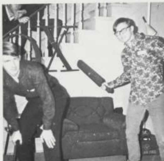
What kind of action is this?