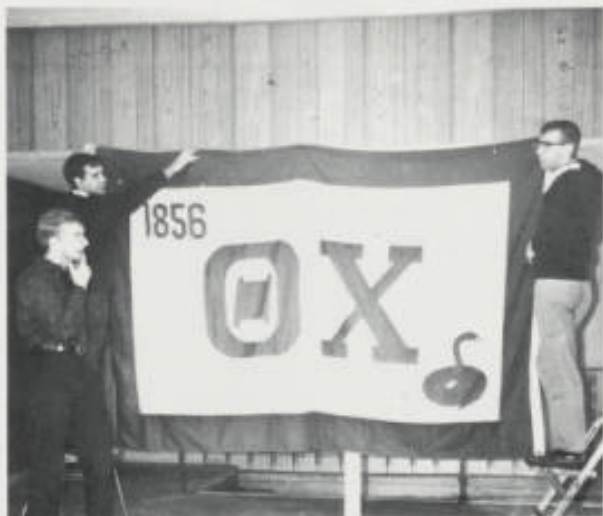
The Brothers do a little interior decorating.